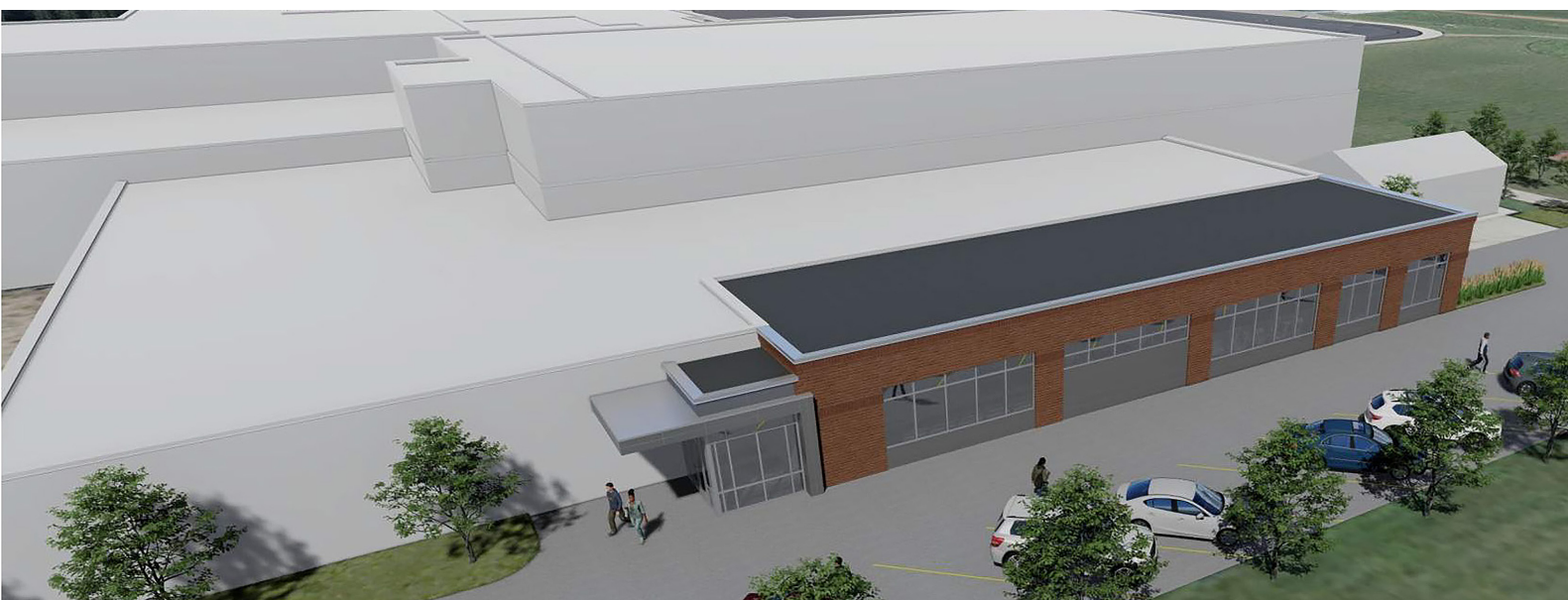
The Wellness Center will be an addition to the south side of the existing WCA Secondary School.

The $1.5M Wellness Center—a new 3,500 square foot classroom—will provide a space for collaboration and active learning for all activities and levels of participation. The Wellness Center will be an accessible addition to the WCA Secondary School and will be a place for students to learn and practice healthy lifestyles—preparing them to be active, healthy, and engaged citizens. The Wellness Center will be open to the community during non-student use hours.