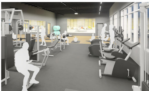
Wellness Center interior renderings